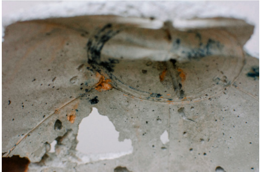
Beyond our control I (detail), concrete and pigments, 26x26x26cm, 2017 © Bikini Art Residency and Lulù Nuti