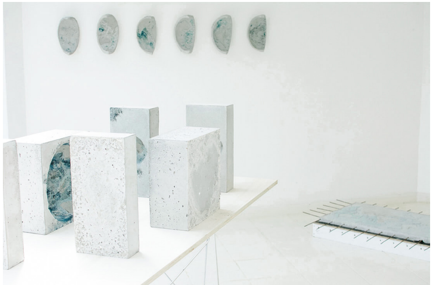
Studio view, Studio visit #2, Calcare il Mondo, 2017 © Bikini Art Residency and Lulù Nuti